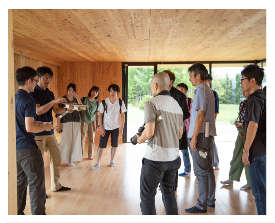
Wooden architecture requires a lot of know-how, with each building type requiring different construction techniques.

Professor Atsushi Takano of Kagoshima University, another one of the course conveners, explained that, despite the attractions of wooden architecture, it is very important for students to understand they need to think about utilizing them on a case by case basis. "We need to think about these structures from both an architectural side and forestry side so we can protect our forests while also reducing our carbon footprint."