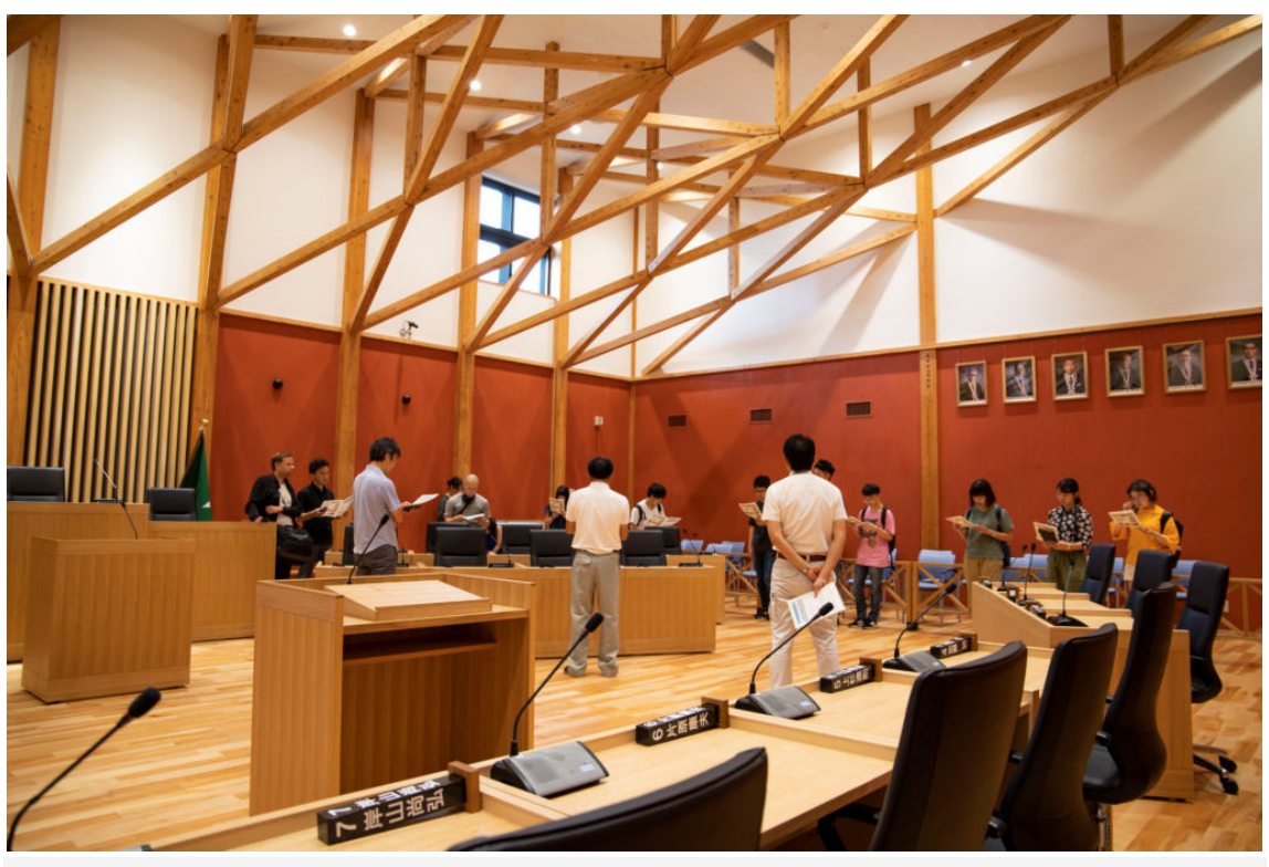
Students at Toma Town Hall

The students then went on a day trip to Northern Hokkaido and were able to see how wooden structures are studied, tested, and constructed at the Forest Products Research Institute, Hokkaido Research Organization, in Asahikawa. Afterwards, they visited and learned about large wooden structures in the area, including Toma Town Hall and Takasu District Community Center "Furatto."