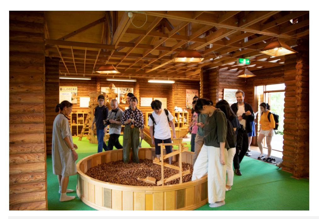
The course participants exploring a nursery primarily made of wood at the Forest Products Research Institute, Asahikawa